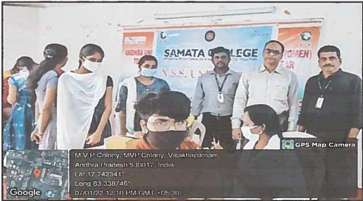
Students and Faculty and General Public Participating and Getting the COVID Vaccination