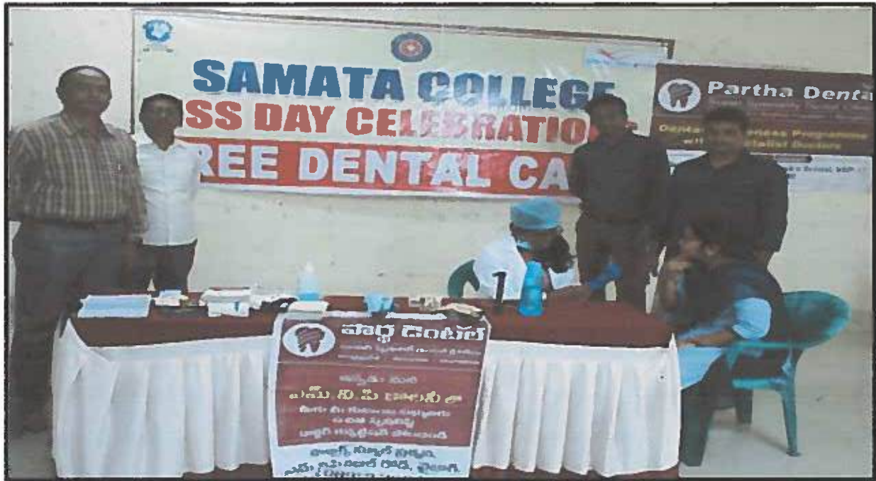
Students and Faculty Participating in Dental Camp