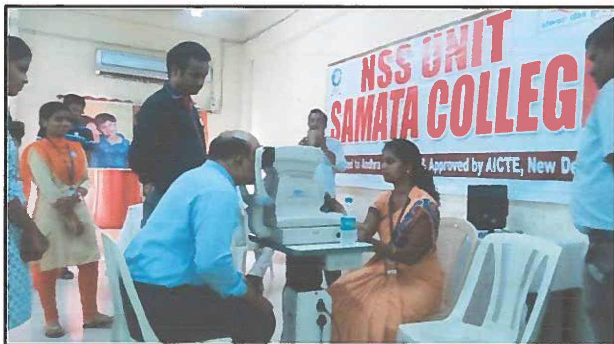
Students and Faculty Participating in Eye Check-up Camp

Phone: 0891 – 2504682. Website: www.samatacollege.co.in