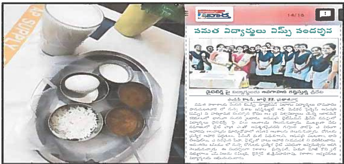
Role of Diet and Nutrition for Cancer Patients in Treating Cancer Drive Published in Newspaper