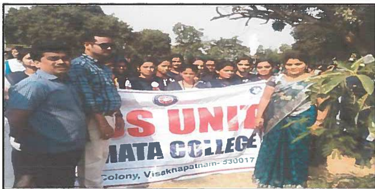
Faculty and Students Participating in Medicinal Gardening Program

Phone: 0891 – 2504682. Website: www.samatacollege.co.in