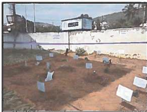
Students Participating and Planted in Medicinal Gardening Program