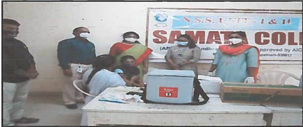
Medical professionals giving COVID Vaccination