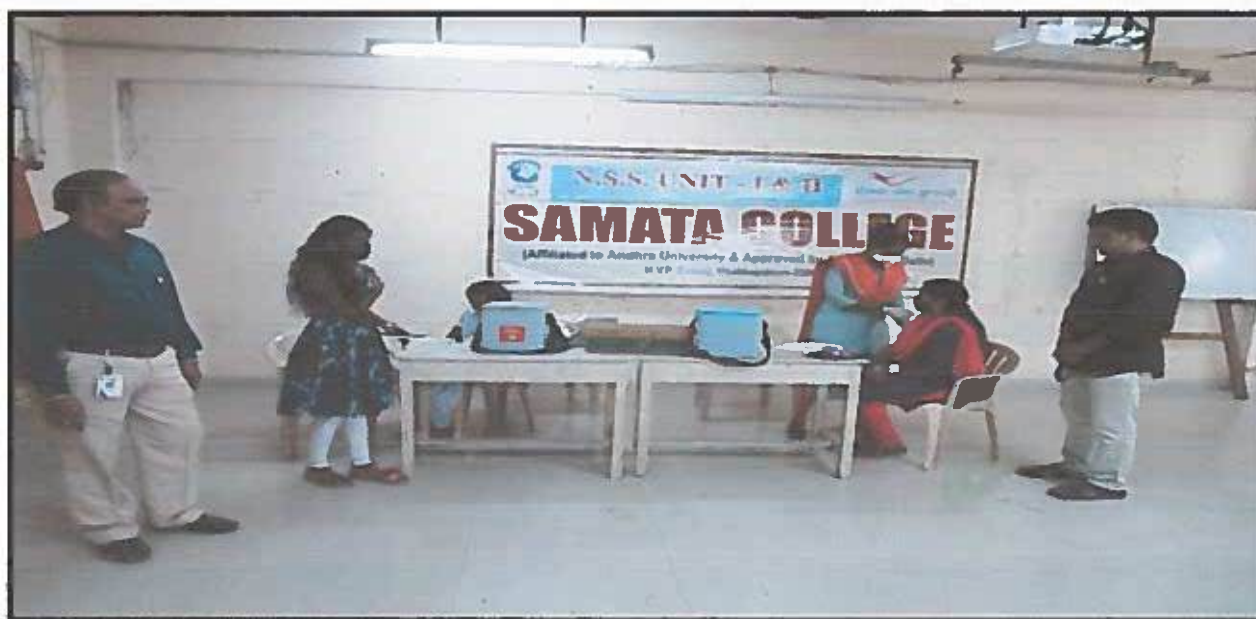
General public Participating in COVID Vaccination Drive

Phone: 0891 – 2504682. Website: www.samatacollege.co.in