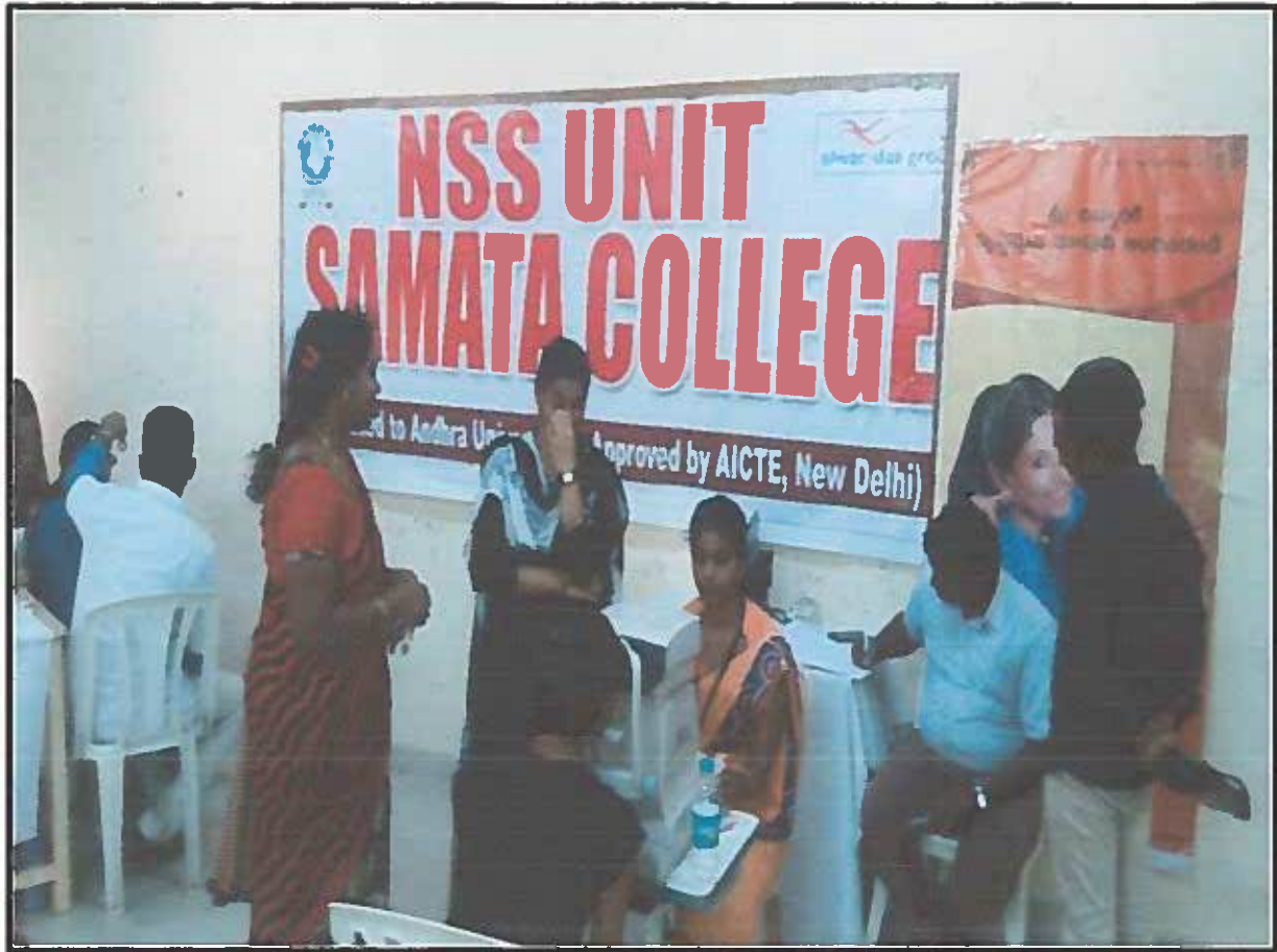
Students and Faculty Participating in Eye Check-up Camp