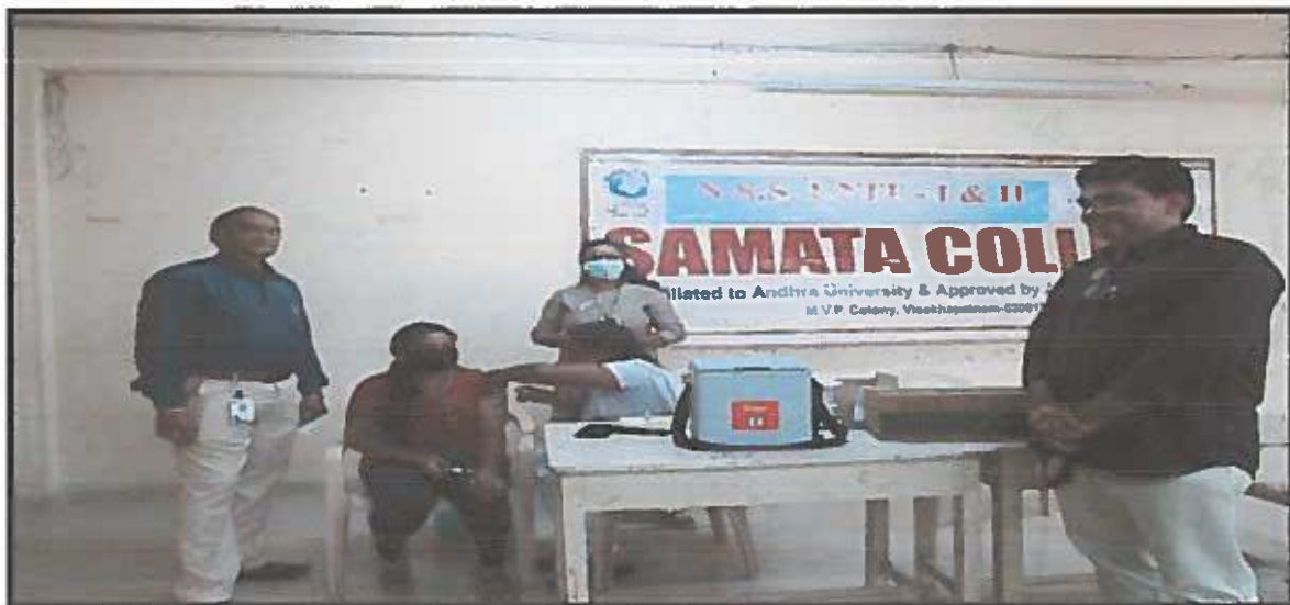
Public getting benefit out of our COVID Vaccination Drive