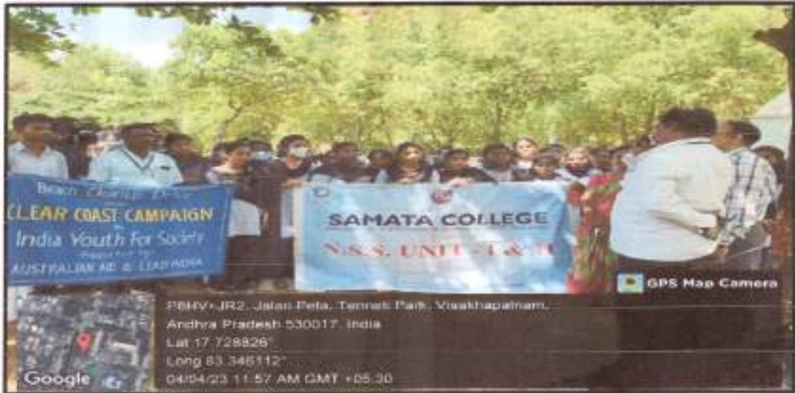
Students and Faculty Participating in Clear Coast Campaign

alwar das group Free school through education