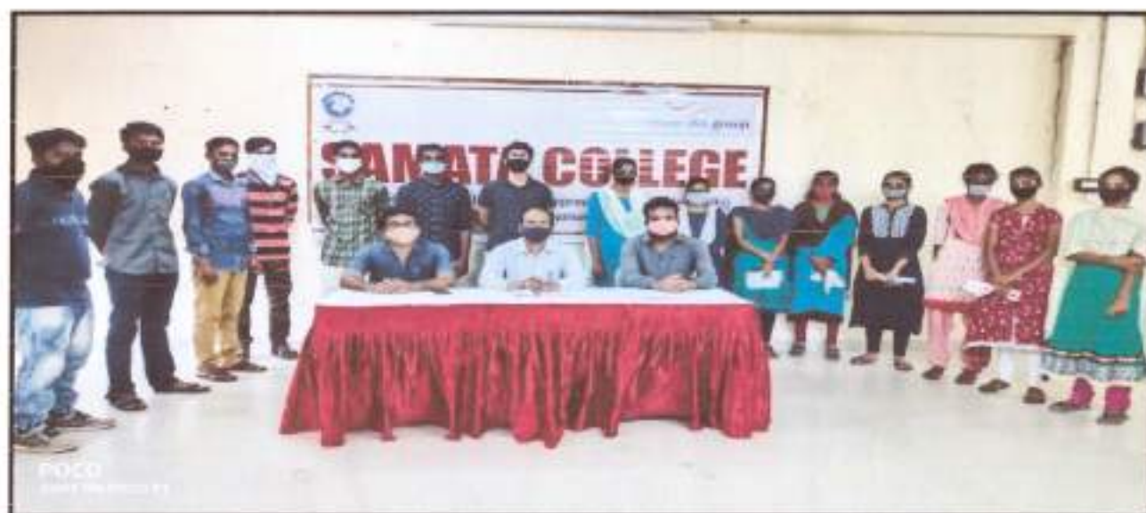
Students Participating in COVID Awareness Campaign

Phone: 0891 – 2504682. Website: www.samatacollege.co.in