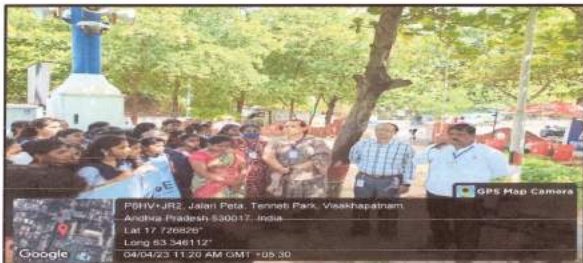
Students and Volunteers in Clear Coast Campaign

Phone: 0891 – 2504682. Website: www.samatacollege.co.in