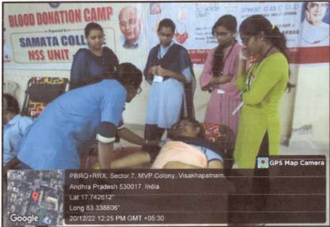
Students Donating Blood in Blood Donation Camp