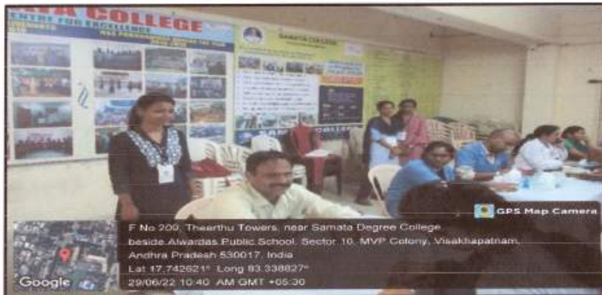
Students Involvement in supporting the Lions club staff