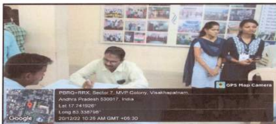
Student Volunteers helping the Rotary Club team in Blood Donation Camp