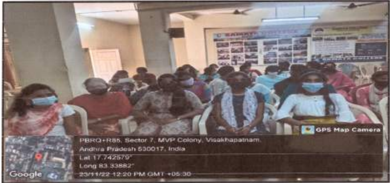
Students Participating in COVID Awareness Campaign