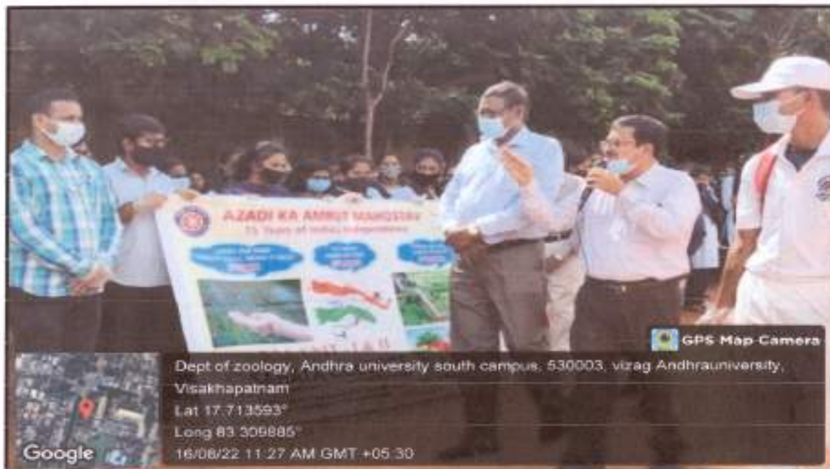
NSS volunteers representing our college participation in Massive Cleaning Program at AU Campus