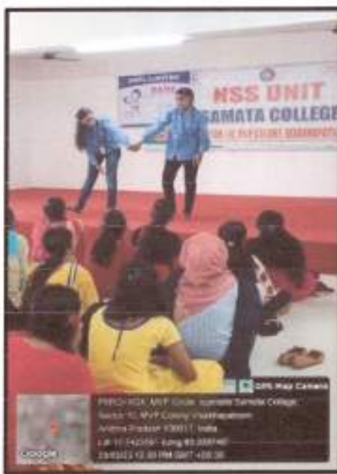
Experts giving instructions in Self-Defence Drive Against Rape and Eve Teasing