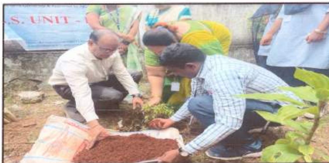
Faculty and Students Participating in the Plantation Drive