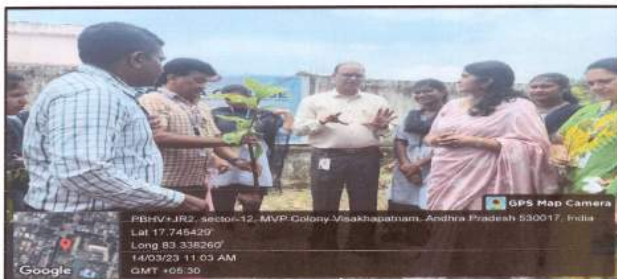
Faculty and Students Participating in the Plantation Drive

Phone: 0891 – 2504682. Website: www.samatacollege.co.in