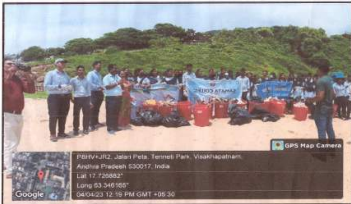
Students Collected the Dry and Wet Waste in Clear Coast Campaign