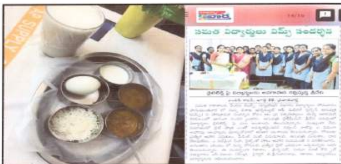
Role of Diet and Nutrition for Cancer Patients in Treating Cancer Drive Published in Newspaper