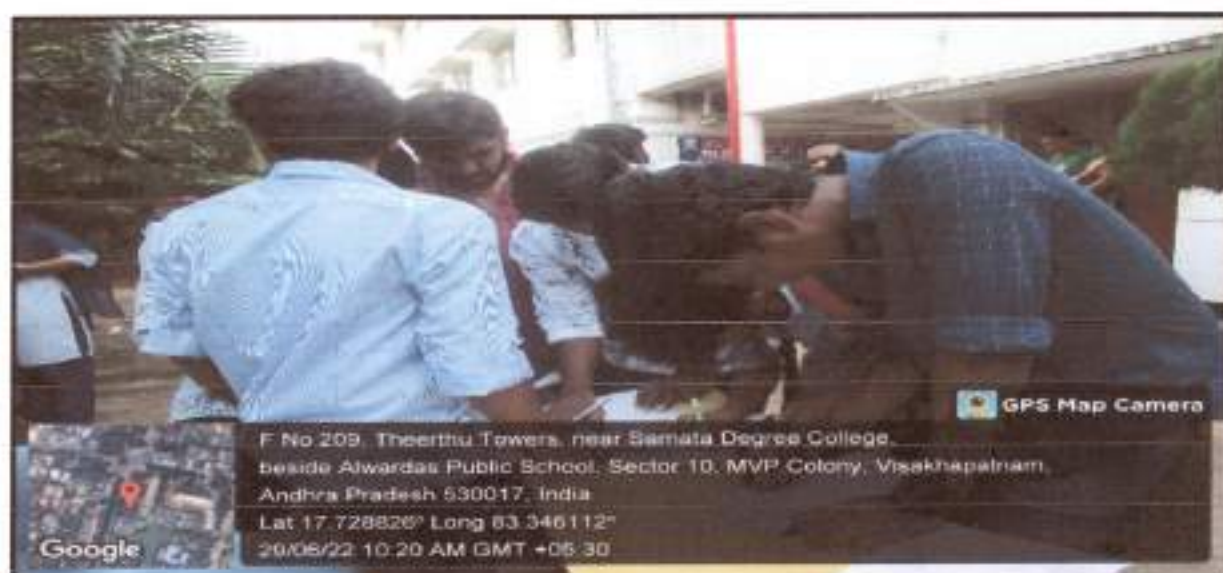
Students Active Participating in Blood Donation Camp

Phone: 0891 – 2504682. Website: www.samatacollege.co.in