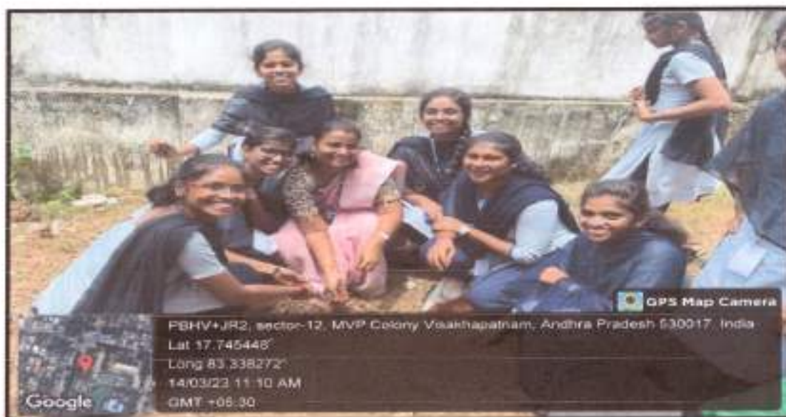
Faculty and Students Participating in the Plantation Drive