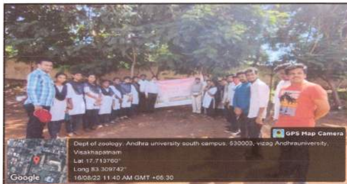
Students Participating in Massive Cleaning Program

Phone: 0891 – 2504682. Website: www.samatacollege.co.in