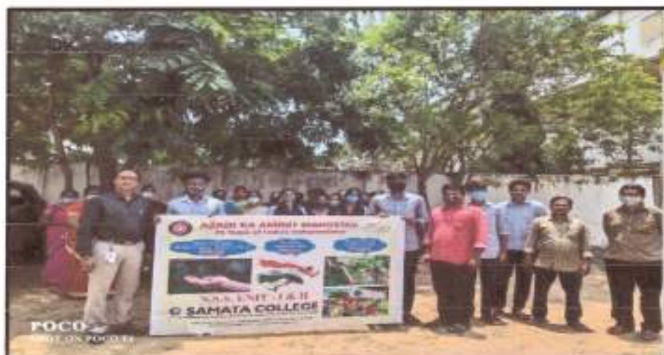
Faculty and Students Participating in Massive Cleaning Program

Phone: 0891 – 2504682. Website: www.samatacollege.co.in