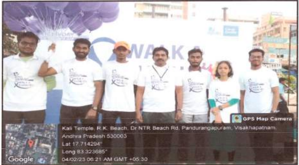
Volunteers Participation in WALK A THON -World Cancer Day