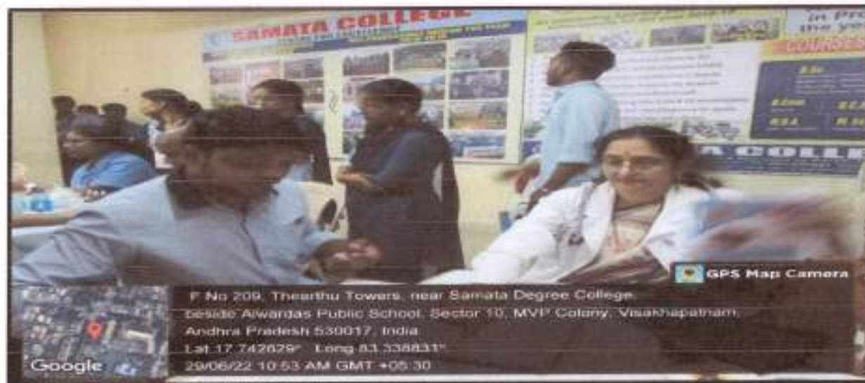
Students Participating in Helping lions club doctor's and staff