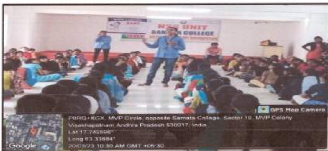
Students Participating in Self-Defence Drive Against Rape and Eve Teasing

Phone: 0891 – 2504682. Website: www.samatacollege.co.in