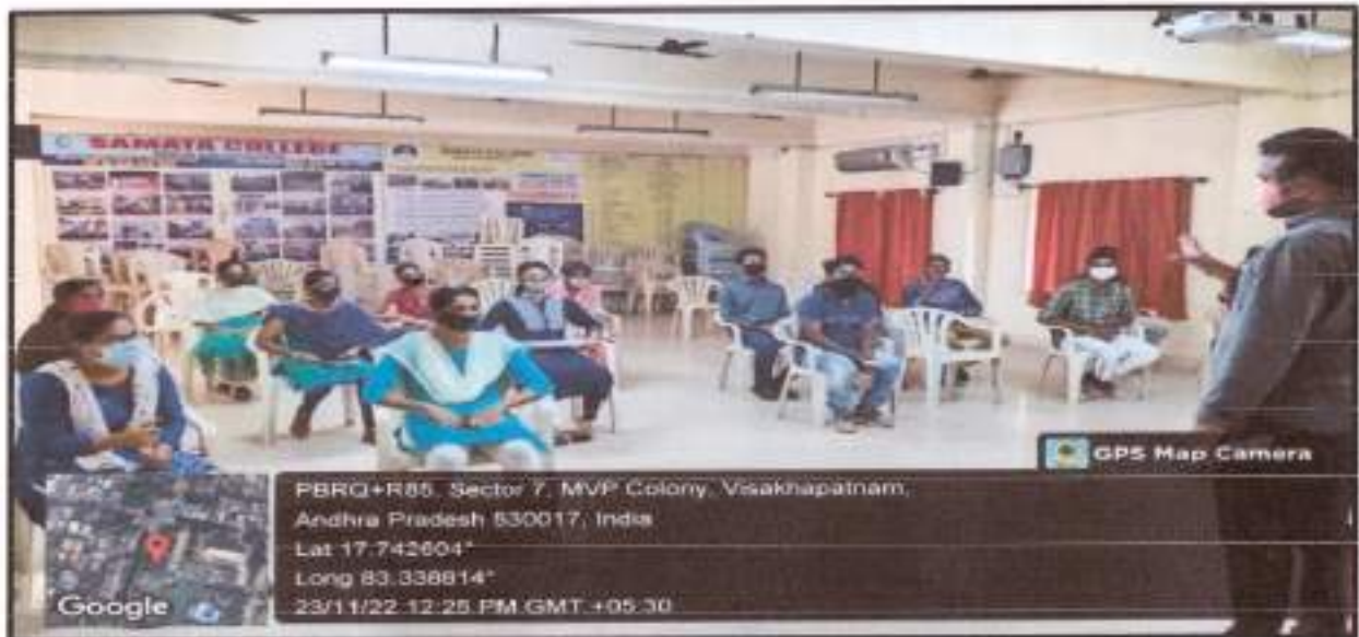
Students Participating in COVID Awareness Campaign