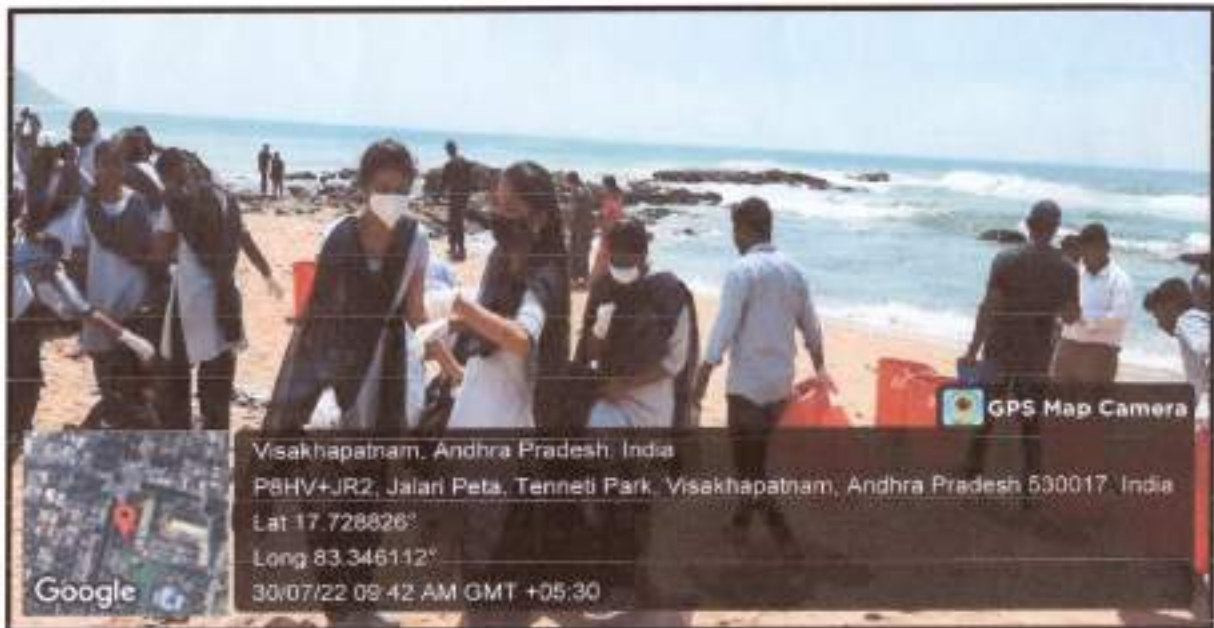
Students Participating in Beach Cleaning Program

Phone: 0891 – 2504682. Website: www.samatacollege.co.in