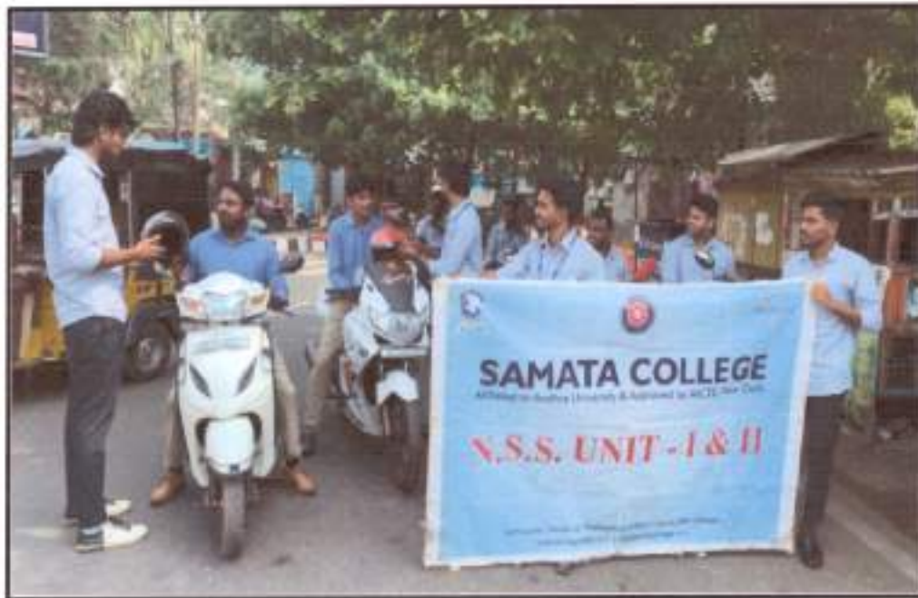
Students Creating Safety Awareness to the Public