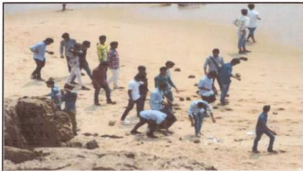
Students active involvement in Beach Cleaning Program