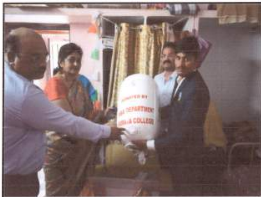
Students and Faculty Participating in Joy of Giving program