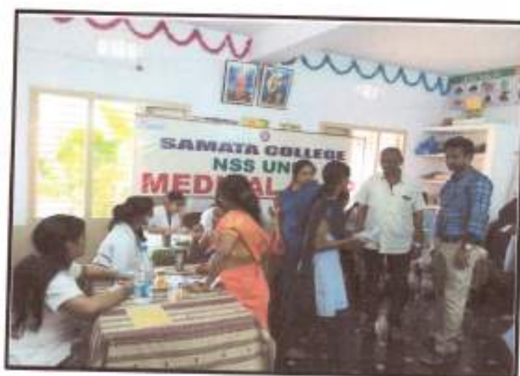
Volunteers Participating in Free Medical Camp and Area Survey

Phone: 0891 – 2504682. Website: www.samatacollege.co.in Email: samatacollege@gmail.com ; drgsrao747@gmail.com