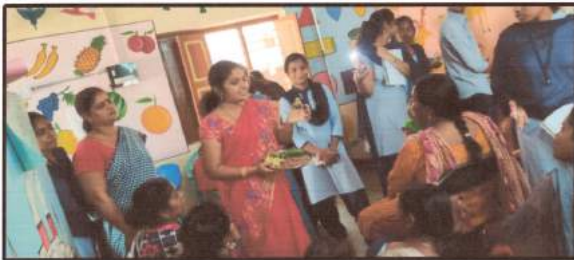
Students along with Faculty interaction with pregnant women at Anganwadi Kendramu, Visakhapatnam.