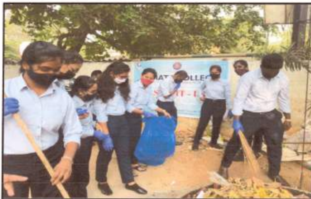
Students Participating in Environmental Sanitation and Disposal of Garbage Drive