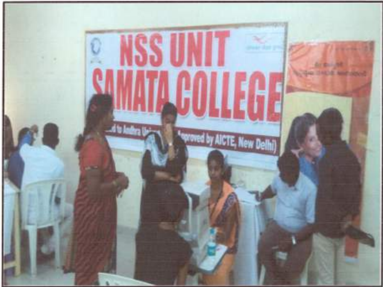
Students and Faculty Participating in Eye Check-up Camp