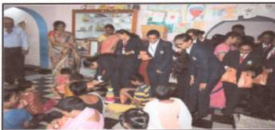
Students and Faculty Participating in Joy of Giving program