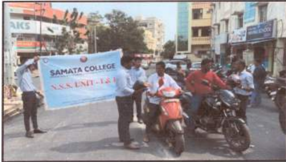
Students Creating Safety Awareness to the Public