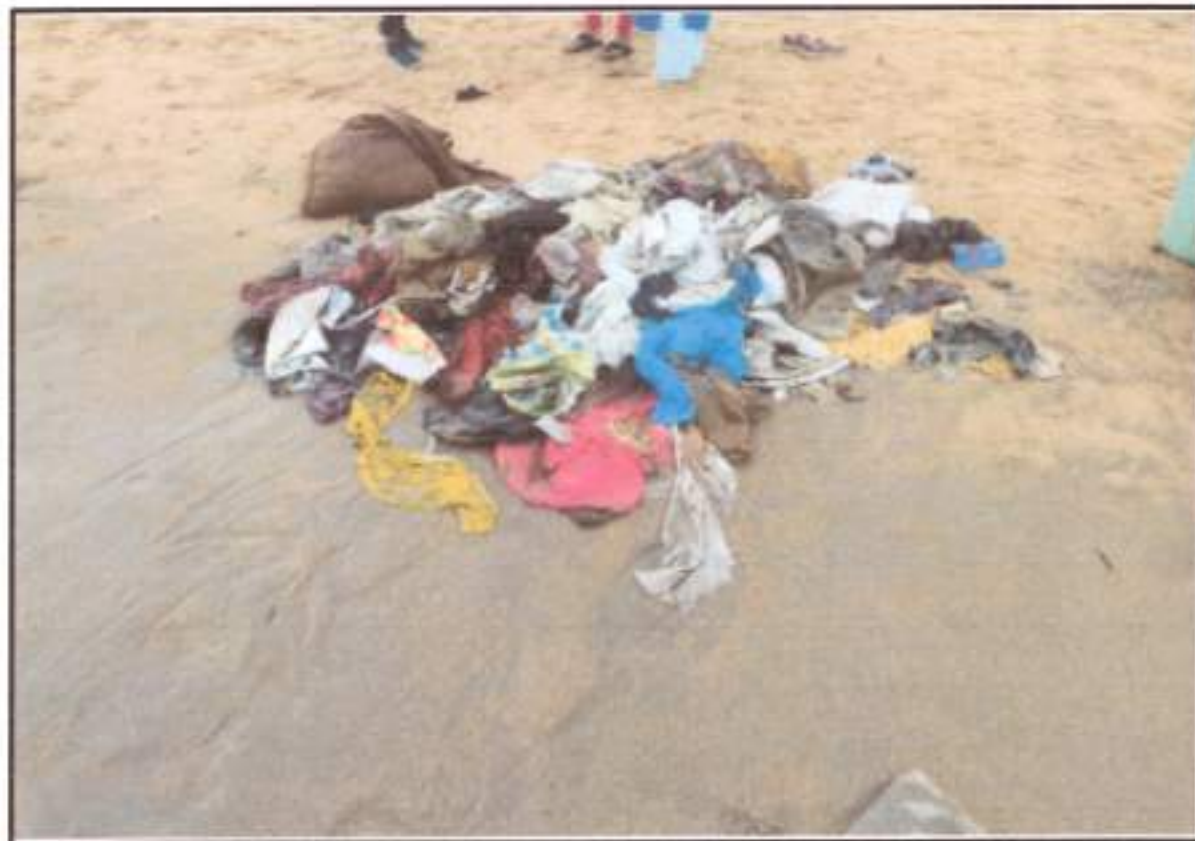
Students Collected the waste in Beach Cleaning Program