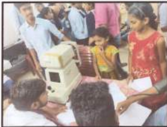
Students Participating in Free Medical Camp and Area Survey.