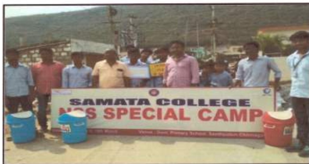
Students Participating in Special Cleaning Campaign