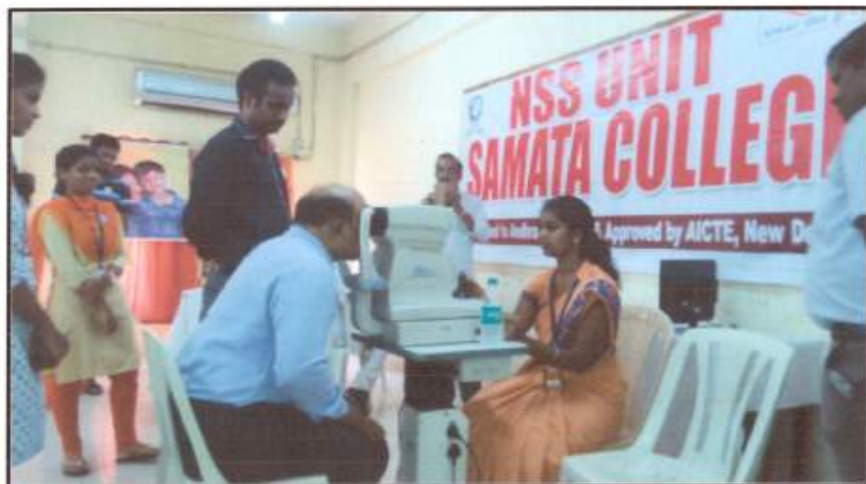
Students and Faculty Participating in Eye Check-up Camp

Phone: 0891 – 2504682. Website: www.samatacollege.co.in