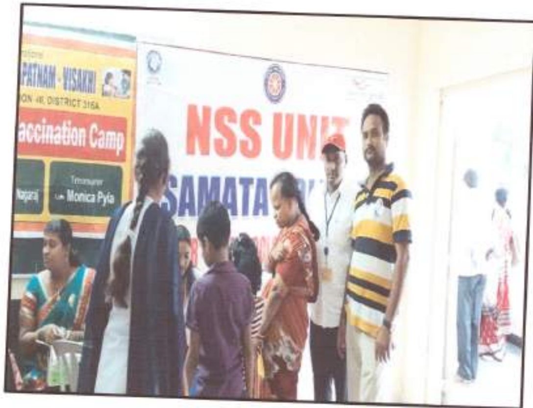
Faculty, Students and General Public Participating in Hepatitis B Vaccination drive