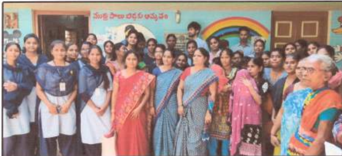
Students Participating in Poshan Abhiyan at Anganwadi Kendramu, Visakhapatnam