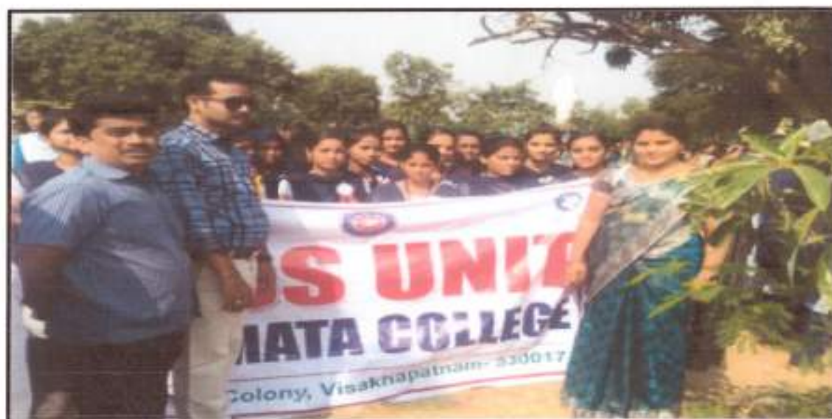
Faculty and Students Participating in Medicinal Gardening Program

Phone: 0891 – 2504682. Website: www.samatacollege.co.in