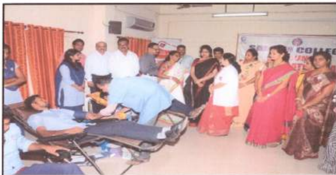
Students Donating Blood