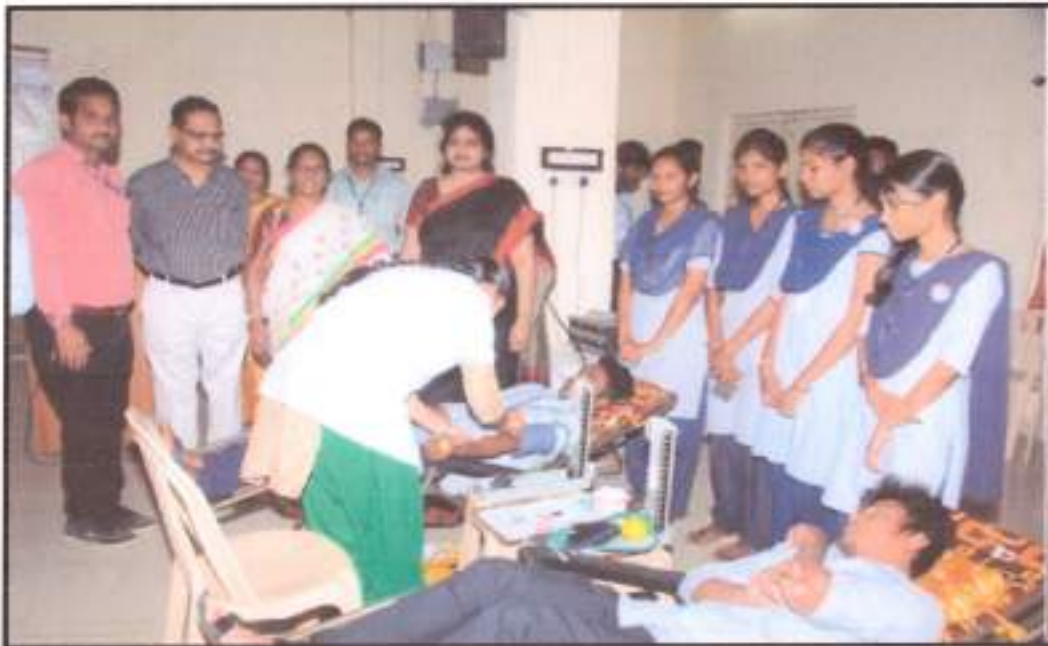
Students Participating in Blood Donation Camp