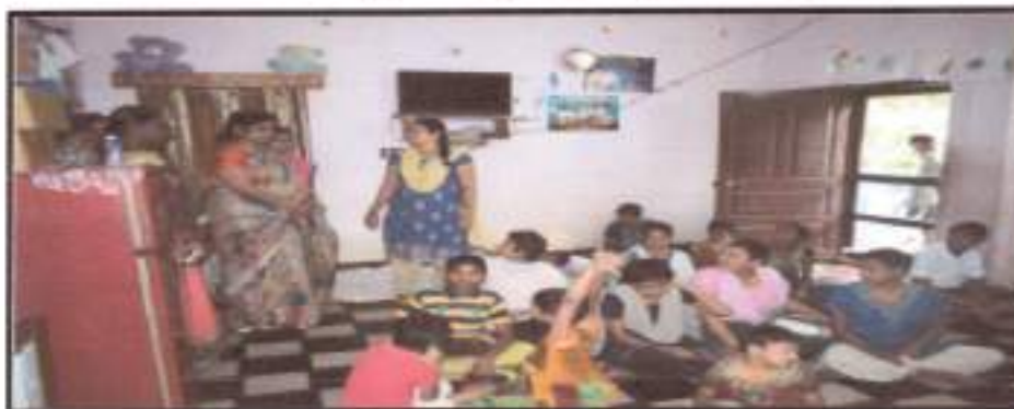
Students and Faculty Participating in Joy of Giving program