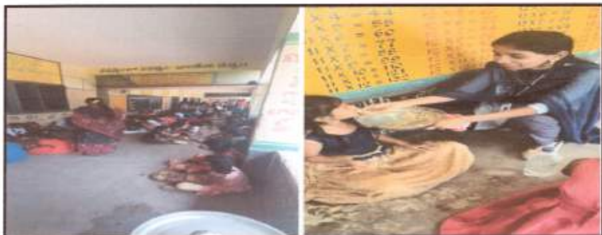
Students Participating in NSS Special Drive