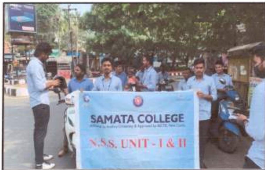
Students Participating in Road Safety Awareness drive