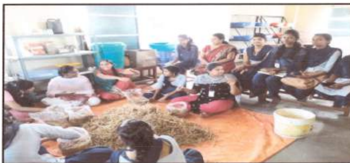
Students Participating in Women Empowerment Drive