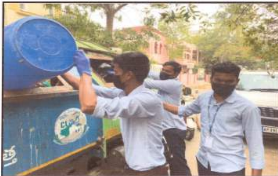
Students Participating in Environmental Sanitation and Disposal of Garbage Drive