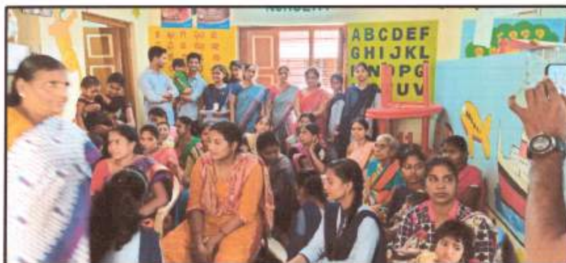
Students Participating in Poshan Abhiyan at Anganwadi Kendramu, Visakhapatnam