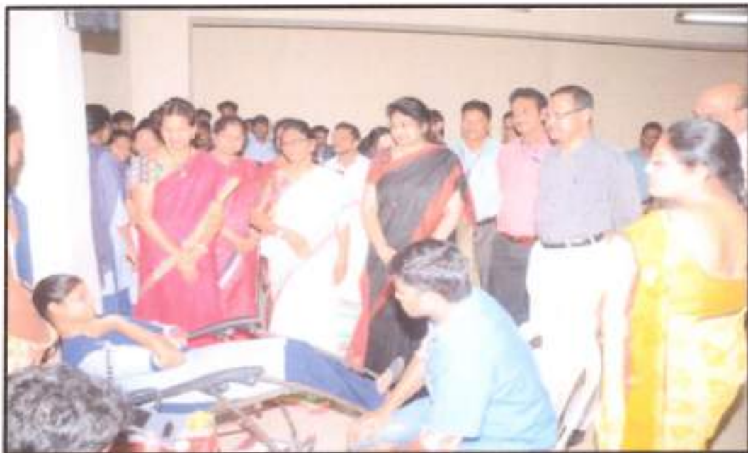
Students Participating in Blood Donation Camp, Visakhapatnam