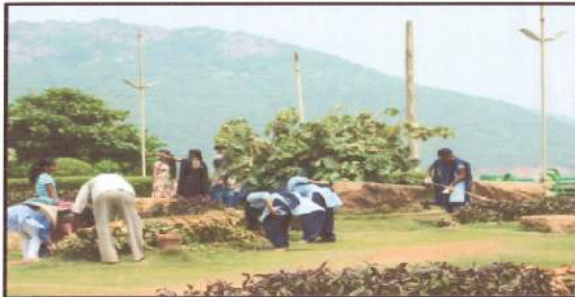
Students Participating in Beach Cleaning Program