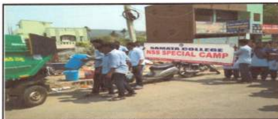
Students Participating in Special Cleaning Campaign