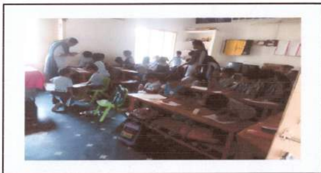
NSS Volunteers teaching techniques and smart learning for primary Children in NSS Special camp