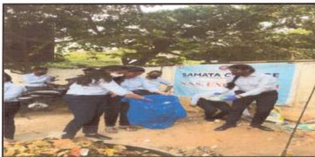
Students Participating in Environmental Sanitation and Disposal of Garbage Drive

Phone: 0891 – 2504682. Website: www.samatacollege.co.in