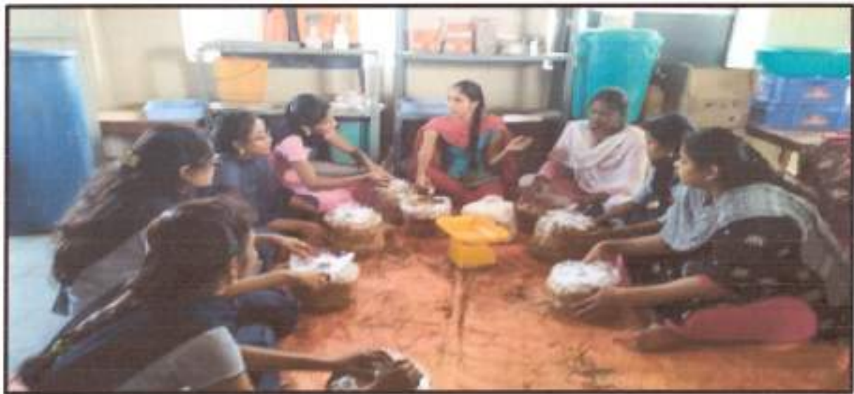
Students Participating in Women Empowerment Drive