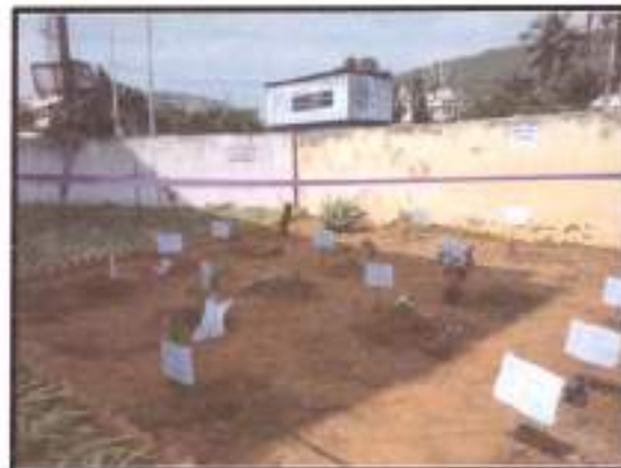
Students Participating and Planted in Medicinal Gardening Program