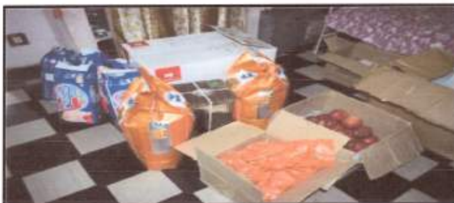
Groceries Donated in Joy of Giving program