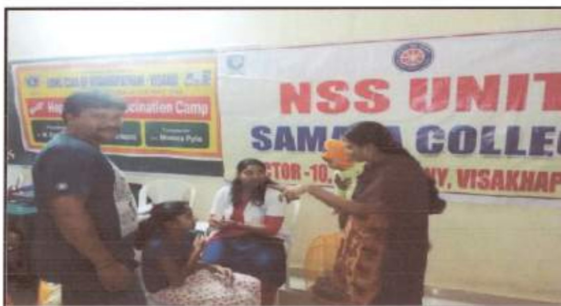
Faculty and Students Participating in Hepatitis B Vaccination drive

Phone: 0891 – 2504682, Website: www.samatacollege.co.in